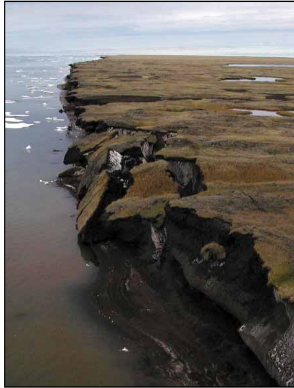
U.S. Geological Survey

Given what we know about the impacts of climate change to ecosystems, species, and cultures, it would be irresponsible to undertake new drilling activities that would accelerate such change and bring harm to wildlife and people.