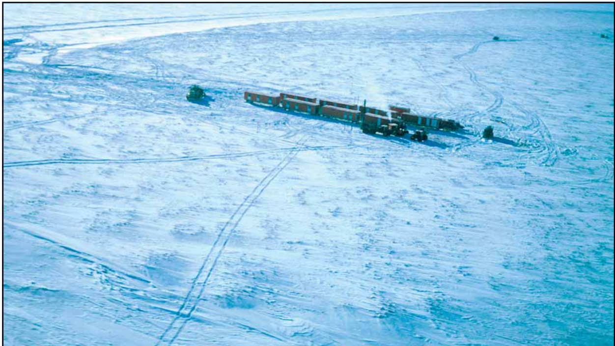
National Oceanic and Atmospheric Administration

Many species of fish and wildlife, including brown bears, polar bears, caribou, muskoxen, and Arctic cisco, remain in Alaska's Arctic all winter and are subject to impacts from exploration and other oil development activities. 16 Muskoxen, for example, frequently use habitats along or adjacent to rivers—locations that are likely to be gravel and water extraction sites for winter road construction. 17 When muskoxen encounter humans or vehicles, they may expend energy that they need to conserve during the long winter in order to successfully reproduce in spring. 18