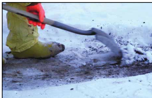
Alaska Department of Environmental Conservation

Oil spills can and do occur during any phase of oil development, from exploration to production to transportation. Increased oil and gas exploration in Alaska, especially offshore, will only add to accumulating impacts and increase the chances of a catastrophic spill.