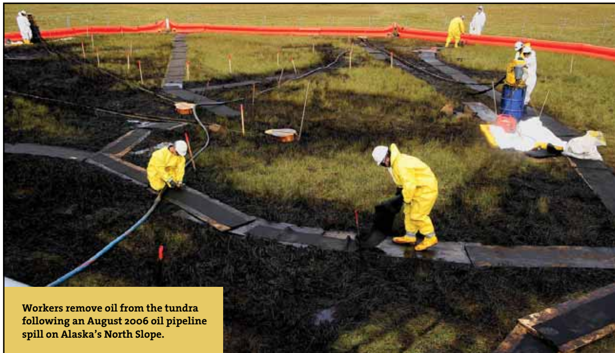
Workers remove oil from the tundra following an August 2006 oil pipeline spill on Alaska's North Slope.