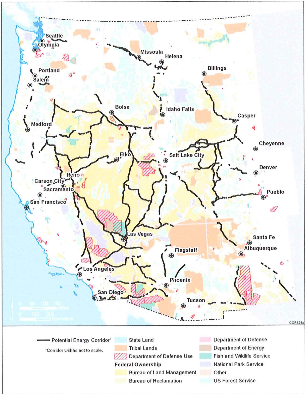
FIGURE 1: Proposed Section 368 Energy Corridors on Federal Lands in the 11 Western States