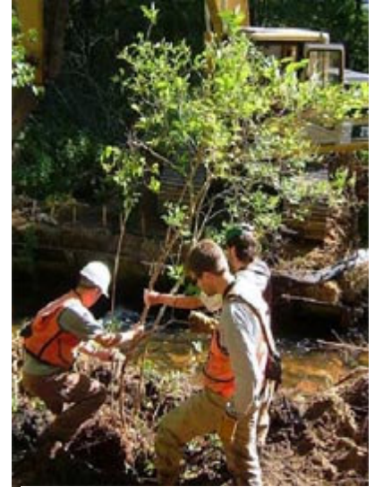
Restoring river habitats protects ecosystems, jobs, and drinking water

This work will protect and create American jobs – providing new skills and income to workers and their families across the state.