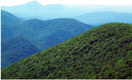
Protecting North Carolina's forests – and the valuable services they provide – will safeguard communities across the state.