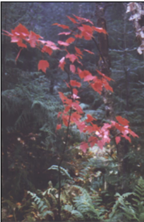
New growth in Breadloaf Wilderness, Green Mountain National Forest.

The economic benefits of wilderness range from the tangible and immediate, like higher property values near protected areas, to the esoteric and distant such