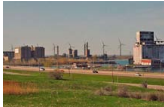
Former Bethlehem Steel site, now used for wind energy generation in Lakawanna, New York.

There is significant potential for renewable energy development on lands that have previously been used for other human purposes, including old industrial sites, former military bases, abandoned mines, and marginal agricultural land. The Environmental Protection Agency is currently conducting a survey of the renewable energy potential of almost 10,000 such sites, including Superfund sites, brownfields, and sites covered by the Resource Conservation and Recovery Act.