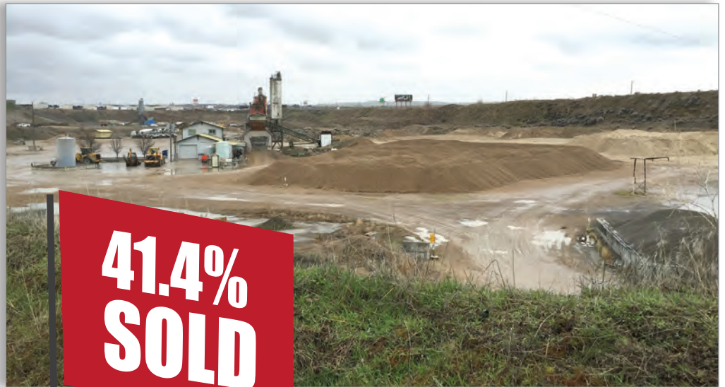
Former state land parcel that is now privately owned.

Access to more than 1.7 million acres of state land has been lost forever after these lands were liquidated to corporations and other private interests — an area approaching the size of the Sawtooth National Forest.