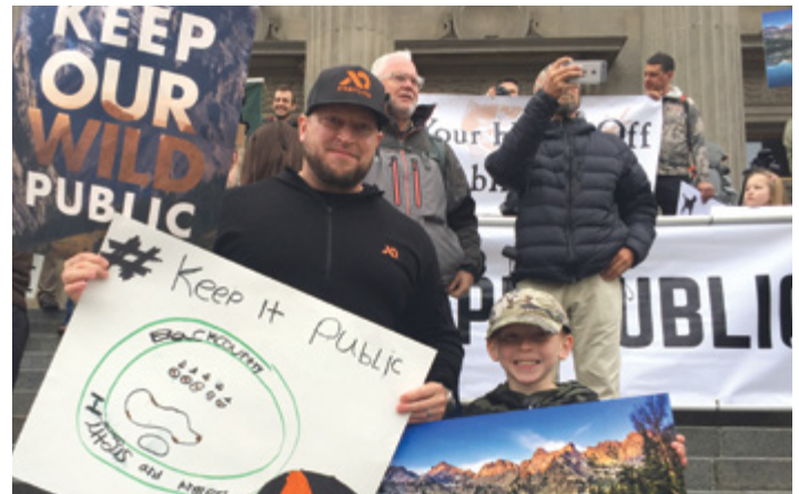
Public land supporters at rallies in several western cities.