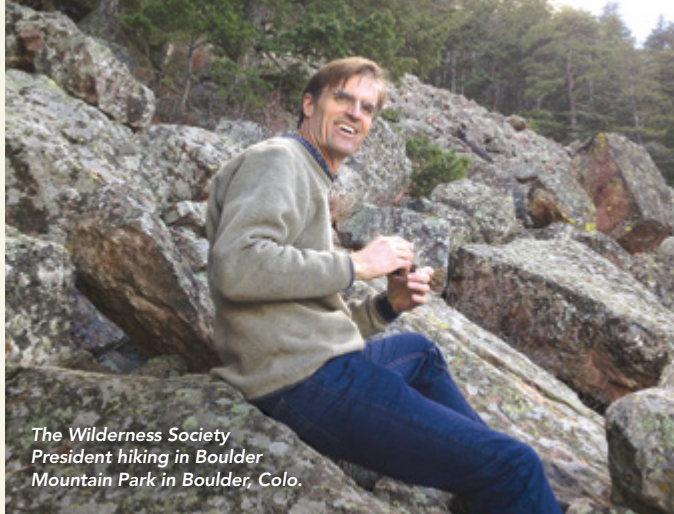
The Wilderness Society President hiking in Boulder Mountain Park in Boulder, Colo.