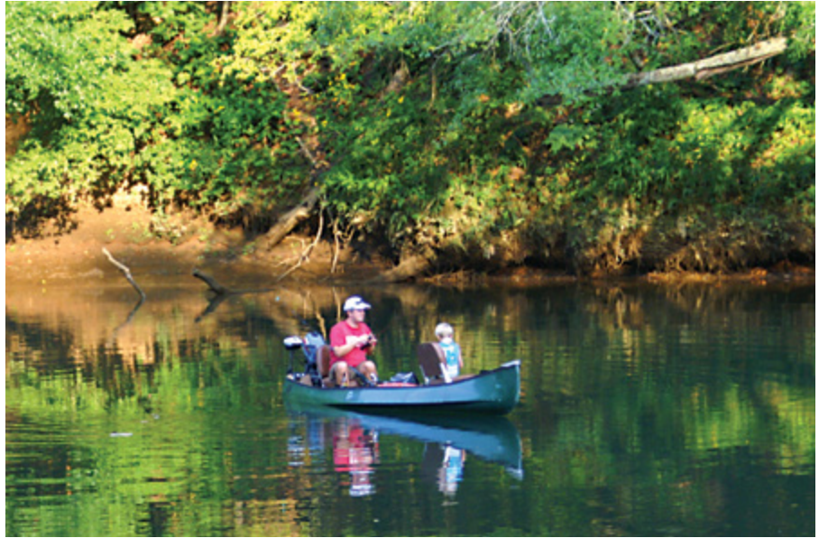
Chattahoochee River National Recreation Area, Ga.

The Chattahoochee River National Recreation Area preserves 76 miles of Chattahoochee riverfront from the headwaters in north Georgia downstream to the city of Columbus. The area includes an exceptional corridor for river recreation and fish and wildlife habitat. Furthermore, it protects drinking water for millions of Georgia residents and provides more than 65 percent of the public green space for the Atlanta metro area.