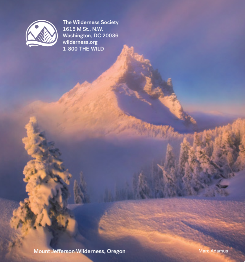
Mount Jefferson Wilderness, Oregon