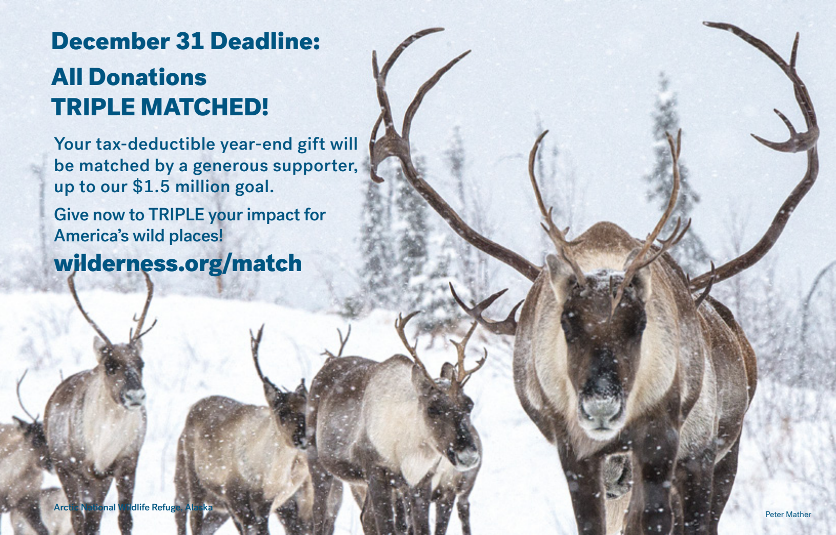
Arctic National Wildlife Refuge, Alaska