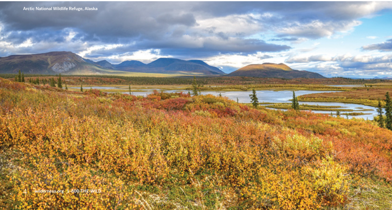
Arctic National Wildlife Refuge, Alaska

Methane Waste Prevention Rule: On July 15, a federal judge invalidated the Trump administration's rollback of the Methane Waste Prevention Rule. Enacted in 2016, this rule reduces waste and pollution from oil and gas development on public and tribal lands by requiring companies to use proven, low-cost technologies to reduce the gas released through venting, flaring and leaks. The primary component of that gas is methane, a greenhouse gas 87 times more powerful than carbon dioxide. It is the third loss in court for the administration on this issue.