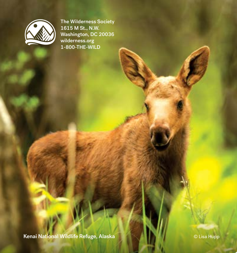
Kenai National Wildlife Refuge, Alaska