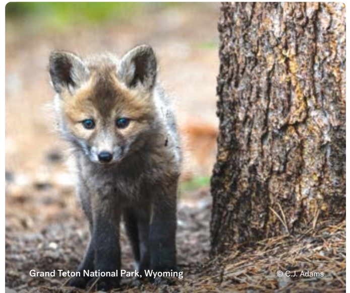
Grand Teton National Park, Wyoming