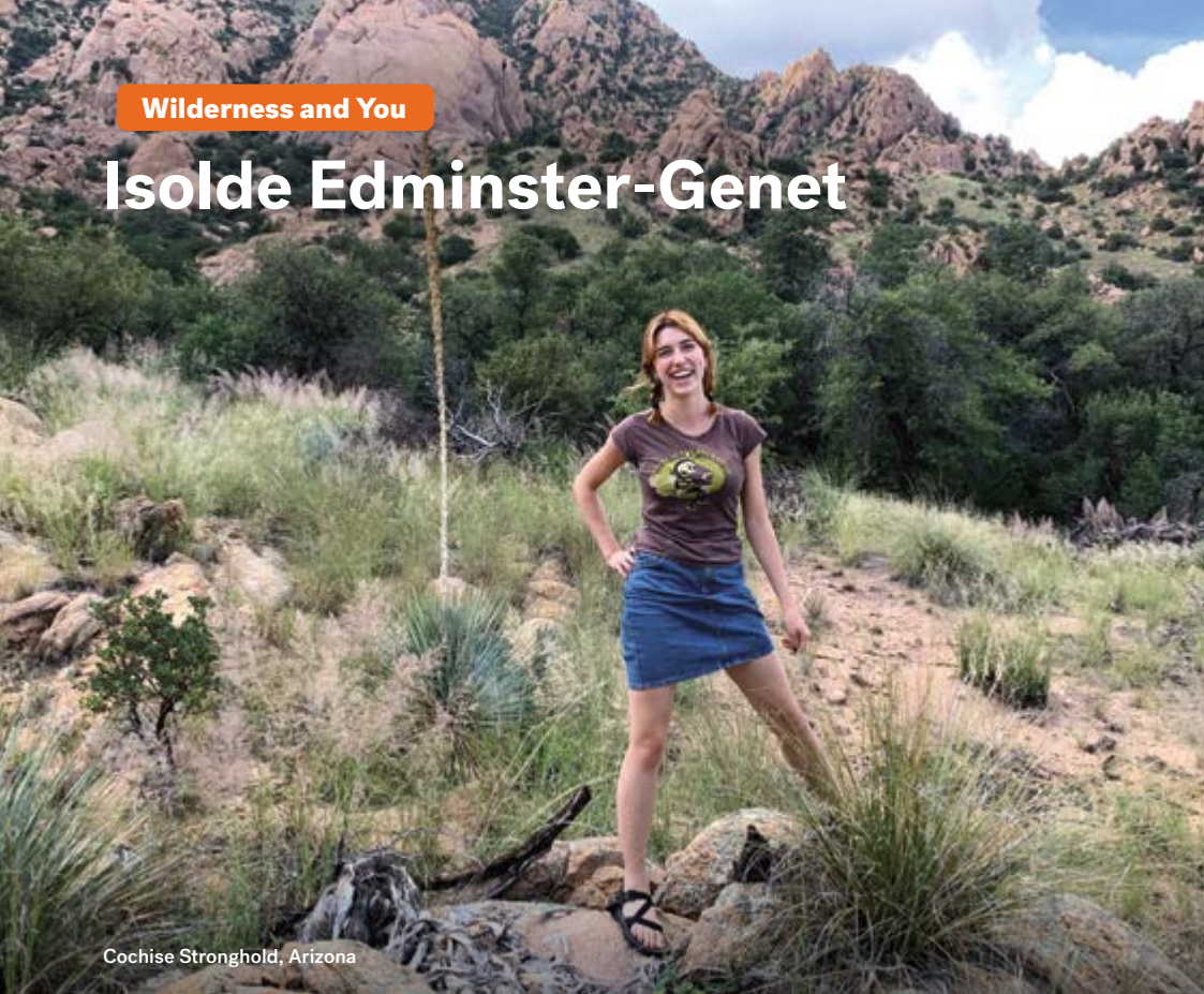
Cochise Stronghold, Arizona