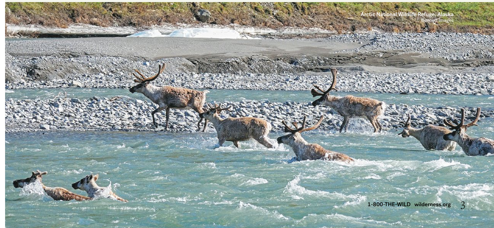
Arctic National Wildlife Refuge, Alaska Bencio Images

The Arctic Refuge is one of the world's last places free from development. The future of this vast, sacred land and its spectacular wildlife depends on us standing with Indigenous communities and supporting their defense of their ancestral homeland. It is the right thing to do. And it brings us closer to the goal we share—to secure permanent protection of the Arctic National Wildlife Refuge once and for all.