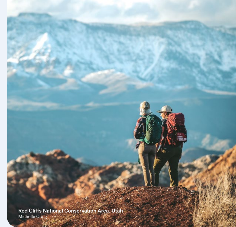
Red Cliffs National Conservation Area, Utah Michelle Craig