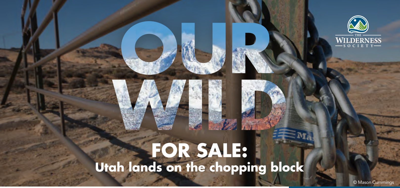
Former public access point to a parcel within Bears Ears National Monument that has been sold off to private interests.