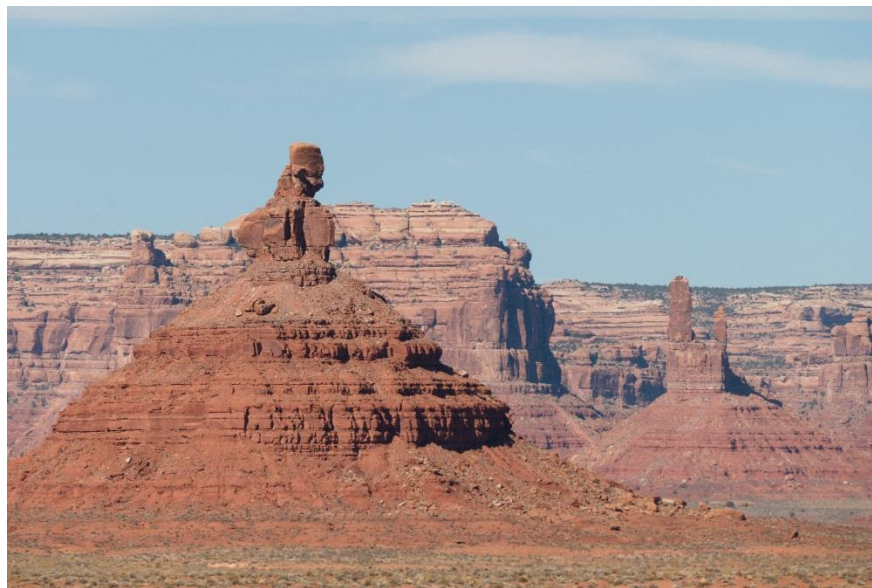
Fig. 4: Valley of the Gods

138. The Valley of the Gods, located in the extreme southern extent of the Bears Ears National Monument, is one of the most well photographed areas in the Monument and a place of stunning beauty. With its red rock spires and sweeping vistas, the Valley of the Gods offers a unique perspective on the Monument's geology. The Valley of the Gods also contains oil and gas deposits, and notwithstanding its designation as an area of critical environmental concern, it was often subject to oil and gas leasing and development proposals before the Bears Ears National Monument was established in 2016. Plaintiffs' members often visit Valley of the Gods to photograph and study its remarkable geology, as well as for aesthetic appreciation and solitude. President Trump's proclamation stripped the Valley of the Gods of monument status.