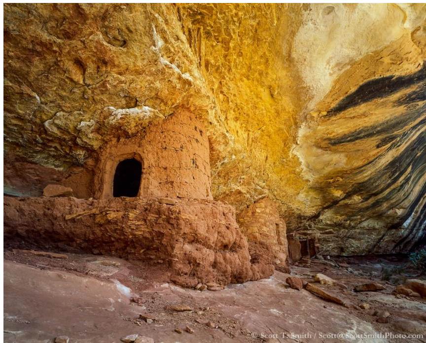
Fig. 3: White Canyon

137. White Canyon is a maze of incised slickrock canyons located on the western end of the Bears Ears National Monument. It is a popular area for canyoneering and contains a high density of cultural sites, including rock art and structures (e.g. granaries and cliff dwellings) that have survived for hundreds and in some cases thousands of years in the Monument's dry environment. White Canyon also contains tar sands and uranium deposits. Prior to the Monument's designation in 2016, it was often the target of leasing proposals and mining claims. Plaintiffs' members often visit White Canyon for spiritual renewal, to appreciate the cultural sites, and to explore the canyon complex. President Trump's proclamation stripped White Canyon of monument status.