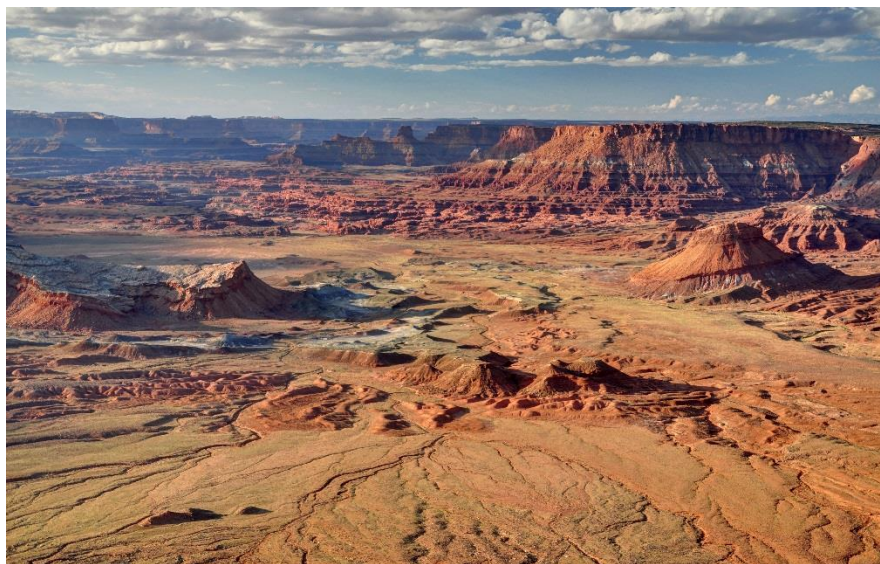
Fig. 2: Lockhart Basin

136. For example, Lockhart Basin, located in the northern extent of Bears Ears National Monument, is rich in cultural resources, native and unique flora and fauna, and remarkable geology. The area has also been targeted for hardrock mining and oil and gas leasing. Members of Plaintiff organizations, including NRDC, SUWA, Sierra Club, and the Center, frequently visit this place to enjoy its scenic beauty and cultural history. President Trump's proclamation stripped Lockhart Basin of monument status.